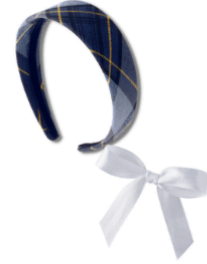
CLASSIC NAVY PLAID HEADBAND (OPTIONAL - LANDS' END)