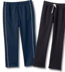
TRACK PANTS OR JOGGERS (NAVY OR BLACK)