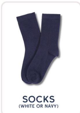
SOCKS (WHITE OR NAVY)