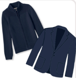
SOLID COLOR NAVY CARDIGAN OR BLAZER