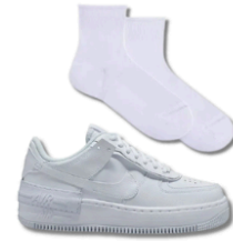
PLAIN ATHLETIC SHOES & SOCKS (NO CARTOON CHARACTERS, FLASHING LIGHTS, ETC)