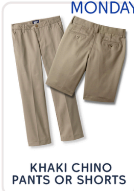
KHAKI CHINO PANTS OR SHORTS