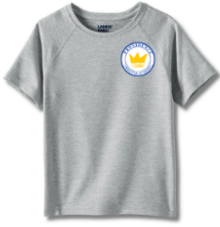
PCA GYM T-SHIRT