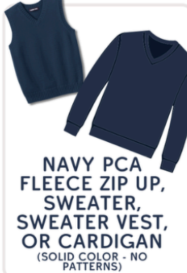
NAVY PCA FLEECE ZIP UP, SWEATER, SWEATER VEST, OR CARDIGAN (SOLID COLOR - NO PATTERNS)