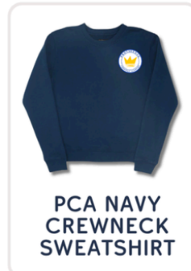
PCA NAVY CREWNECK SWEATSHIRT