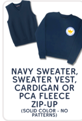
NAVY SWEATER, SWEATER VEST, CARDIGAN OR PCA FLEECE ZIP-UP (SOLID COLOR - NO PATTERNS)