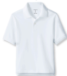
WHITE POLO SHIRT (SHORT OR LONG SLEEVED)

to be worn on Chapel Wednesdays and other formal days as announced throughout the year