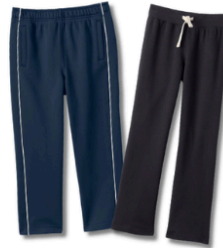
TRACK PANTS OR JOGGERS (NAVY OR BLACK)