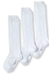
KNEE/ANKLE SOCKS OR TIGHTS (WHITE OR NAVY)