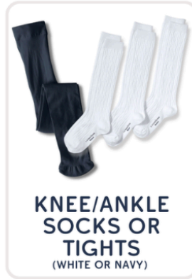
KNEE/ANKLE SOCKS OR TIGHTS (WHITE OR NAVY)