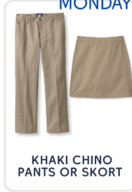
KHAKI CHINO PANTS OR SKORT