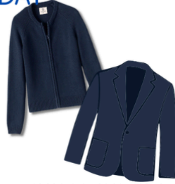
SOLID COLOR NAVY CARDIGAN, BLAZER, OR ZIP-UP