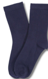
SOCKS (WHITE OR NAVY)