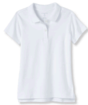
WHITE POLO SHIRT (SHORT OR LONG SLEEVED)

to be worn on Chapel Wednesdays and other formal days as announced throughout the year