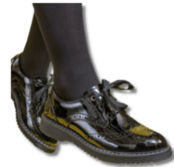
DRESS SHOES (BROWN, BLACK, OR NAVY BLUE)

Black or navy cartwheel or compression ("cyclist") shorts are to be worn under skirts and jumpers. Updated May 2026