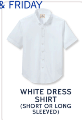
WHITE DRESS SHIRT (SHORT OR LONG SLEEVED)