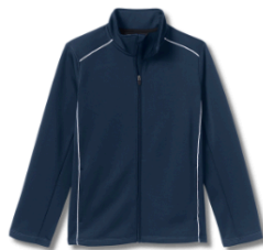
TRACK JACKET (OPTIONAL; NAVY OR BLACK)

To be worn to school on Gym days. (2024-25: Tuesdays and Thursdays)