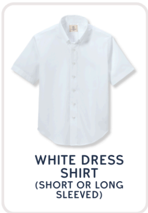
WHITE DRESS SHIRT (SHORT OR LONG SLEEVED)