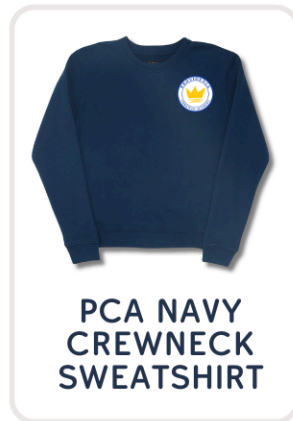
PCA NAVY CREWNECK SWEATSHIRT