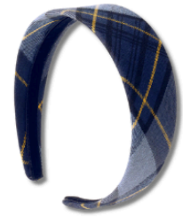
CLASSIC NAVY PLAID HEADBAND (OPTIONAL - LANDS' END)