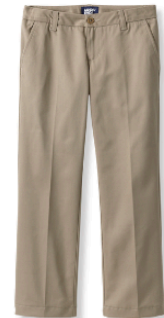
KHAKI CHINO PANTS