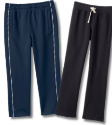
TRACK PANTS OR JOGGERS (NAVY OR BLACK)