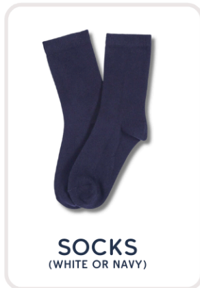
SOCKS (WHITE OR NAVY)