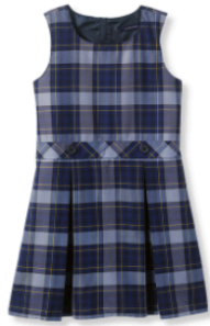
CLASSIC NAVY PLAID JUMPER (LANDS' END)