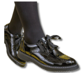
DRESS SHOES (BROWN, BLACK, NAVY BLUE, OR WHITE)

Black or navy cartwheel or compression ("cyclist") shorts are to be worn under skirts and jumpers.