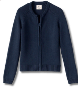
SOLID COLOR NAVY CARDIGAN (OPTIONAL)