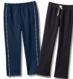
TRACK PANTS OR JOGGERS (NAVY OR BLACK)