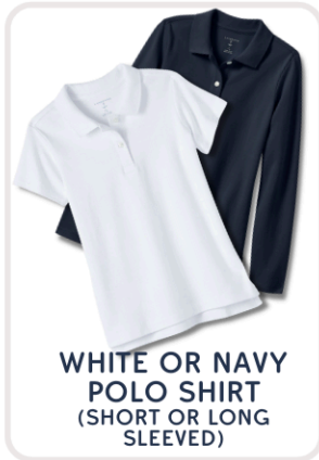
WHITE OR NAVY POLO SHIRT (SHORT OR LONG SLEEVED)