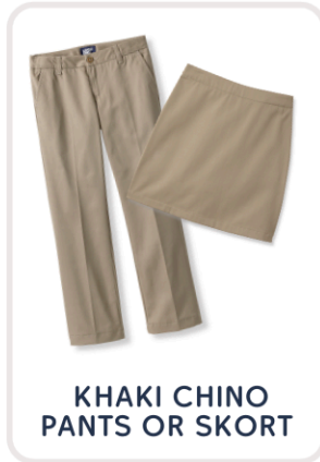
KHAKI CHINO PANTS OR SKORT