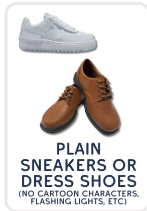
PLAIN SNEAKERS OR DRESS SHOES (NO CARTOON CHARACTERS, FLASHING LIGHTS, ETC)