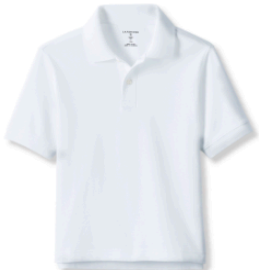
WHITE POLO SHIRT (SHORT OR LONG SLEEVED)

to be worn on Chapel Wednesdays and other formal days as announced throughout the year