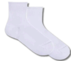
PLAIN ATHLETIC SOCKS (NO CARTOON CHARACTERS, BRIGHT COLORS, ETC.)