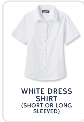
WHITE DRESS SHIRT (SHORT OR LONG SLEEVED)