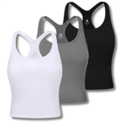
FULL LENGTH SPORTS TANK TOP (WHITE, BLACK, GRAY, OR NAVY; TO BE WORN UNDER T-SHIRT)