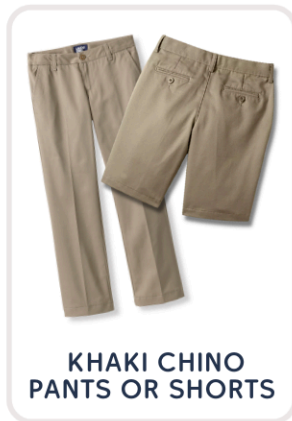
KHAKI CHINO PANTS OR SHORTS