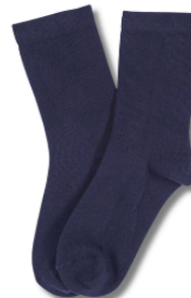
SOCKS (WHITE OR NAVY)