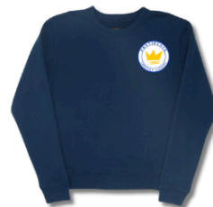
PCA NAVY CREWNECK SWEATSHIRT