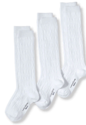
KNEE/ANKLE SOCKS OR TIGHTS (WHITE OR NAVY)