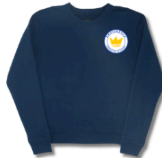
PCA NAVY CREWNECK SWEATSHIRT