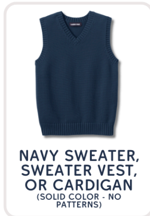
NAVY SWEATER, SWEATER VEST, OR CARDIGAN (SOLID COLOR - NO PATTERNS)