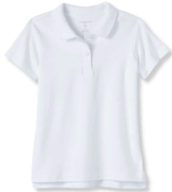
WHITE POLO SHIRT (SHORT OR LONG SLEEVED)

to be worn on Chapel Wednesdays and other formal days as announced throughout the year