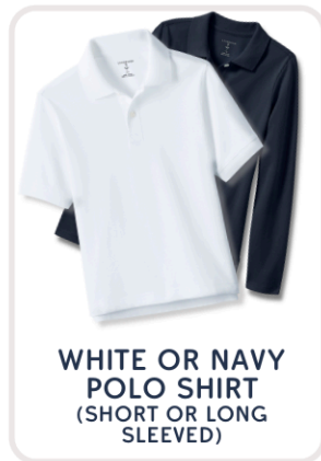
WHITE OR NAVY POLO SHIRT (SHORT OR LONG SLEEVED)

Black or navy cartwheel or compression ("cyclist") shorts are to be worn under skirts and jumpers. Updated June 17, 2024