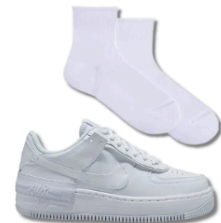
PLAIN ATHLETIC SHOES & SOCKS (NO CARTOON CHARACTERS, FLASHING LIGHTS, ETC.)