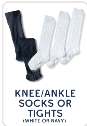
KNEE/ANKLE SOCKS OR TIGHTS (WHITE OR NAVY)