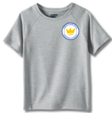
PCA GYM T-SHIRT