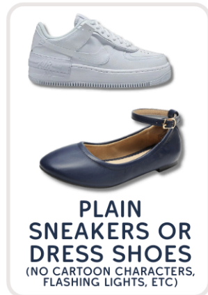
PLAIN SNEAKERS OR DRESS SHOES (NO CARTOON CHARACTERS, FLASHING LIGHTS, ETC)

Black or navy cartwheel or compression ("cyclist") shorts are to be worn under skirts and jumpers. Updated June 17, 2024